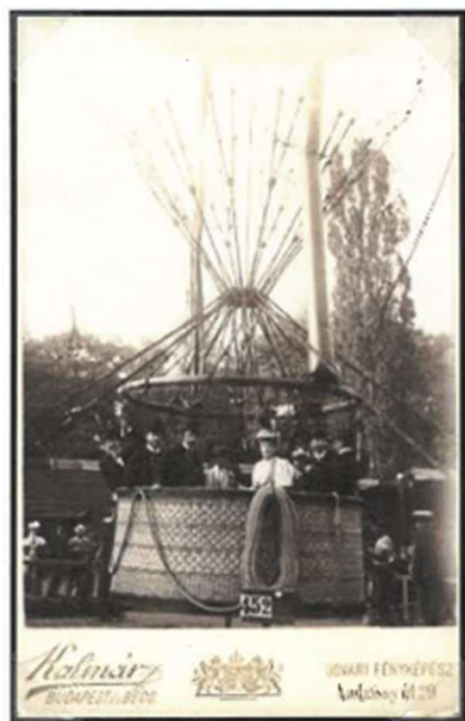
Copy of a photograph of the basket with passengers

Greetings from the skies! Commemorative picture postcard of the Godard Balloon with an overview of the Exhibition site.