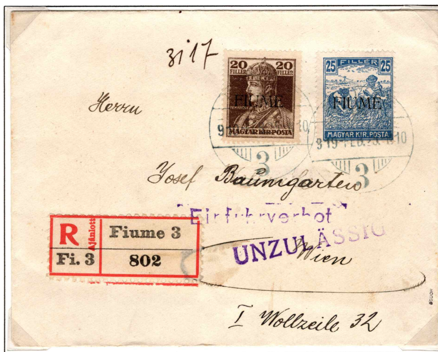
1919 registered entire to Vienna containing newspaper cutting, franked by King Karol 20f, Harvester 25f stamps overprinted Fiume . Fiume cds 1919 Feb 20. Einfuhrverbot – importation refused; Unzulässig – inadmissible. Returned. Fiume receive mark on reverse, 7 Mar 1919.