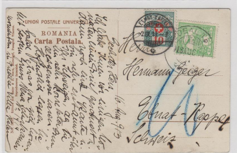
Picture postcard with „Predealtelep N” cancellation, with 17th August, 1913 date, to Ebnat-Kappel (Switzerland) tied by 5 fillér „Turul” stamp accepted by the Hungarian post, but was punished by the Swiss with a 10 Ct (Swiss centime) postage due.