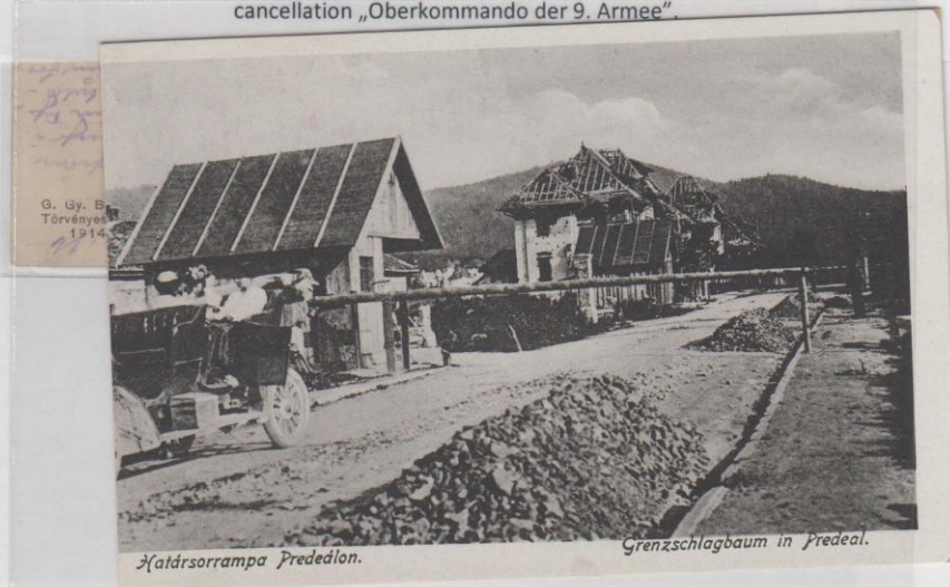
Predeal and the „2nd period of the Hungarian Post in Romania” was completely ruined by the war. The idillic picture of the border has changed forever.