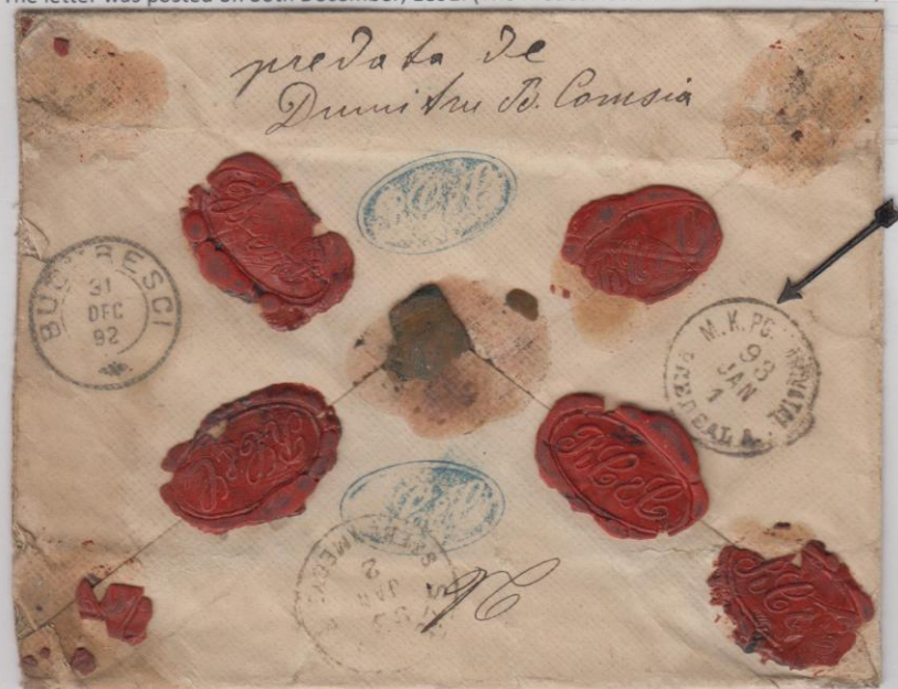
Back: „Bucuresci” (31st December, 1892) and „Predeal” (1st January, 1893) transit cancellations. The letter was delivered on the 2nd January, 1893.